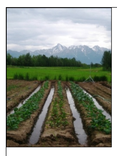
ASPGB People's Garden 2010.

The people's garden, managed by repository staff, produced about 434 pounds of cabbage and 156.5 pounds of zucchini that were donated to the Food Pantry of Wasilla, Alaska.